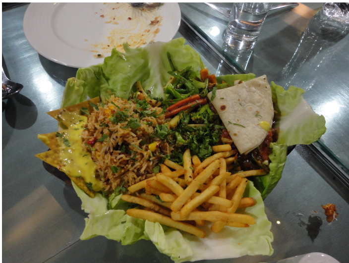
This is mexican food in India. Surprisingly good.