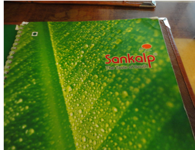
These are pictures of Sankalp, a restaurant that serves South-Indian food.