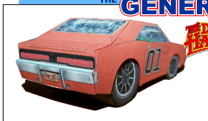
PHOTOS OF ACTUAL ASSEMBLED MODEL