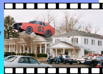
ACTUAL SCENE FROM THE TV SHOW!

NOT FOR SALE OR RESALE. DO NOT COPY- DO NOT REDISTRIBUTE. DO NOT SHARE WITHOUT PERMISSION. THIS MODEL IS TO BE CONSIDERED "FAN-ART" AND IS PURELY FOR PRIVATE USE AND ENTERTAINMENT PURPOSES.